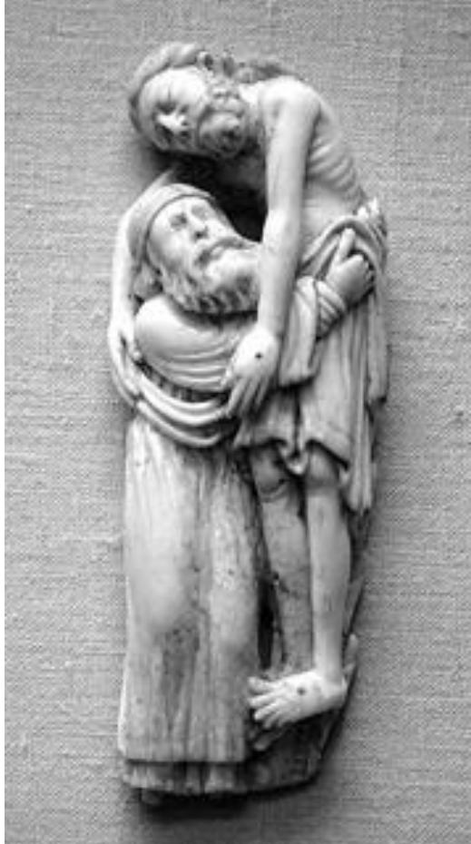
Joseph of Arimathea Lowers Christ from the Cross, from Art in the Christian Tradition

47 When the centurion saw what had taken place, he praised God and said, “Certainly this man was innocent.” 48 And when all the crowds who had gathered there for this spectacle saw what had taken place, they returned home, beating their breasts. 49 But all his acquaintances, including the women who had followed him from Galilee, stood at a distance, watching these things.